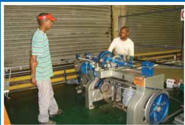
Students working on wire making machine

The TDTC project is also focusing to serve the needs of the College and the Department of Education in terms of the supply of exercise books, examination writing pads and other stationery needs.