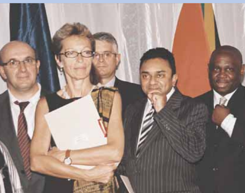
Representatives from the French Embassy, University of KwaZulu Natal and the Department of Education

Students will write their final examinations set by the French Embassy and get a certificate for competence in the French language.