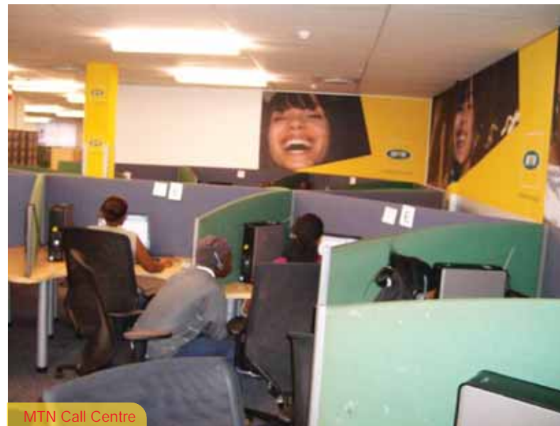
MTN Call Centre