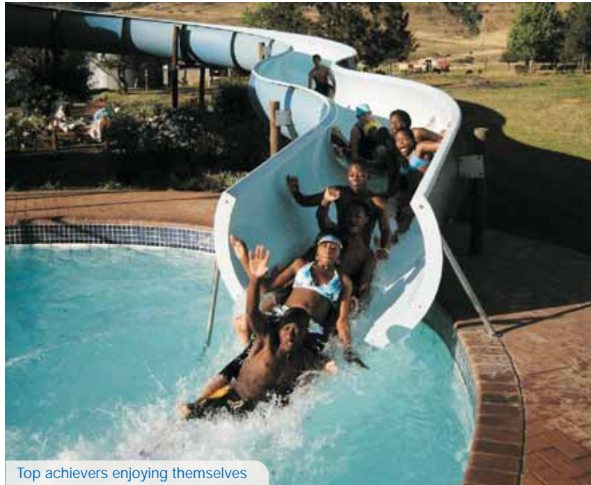
Top achievers enjoying themselves

Students spent 3 days in the Drakensburg. Whilst there they visited Eskom Hydro-electric power Plant which is the largest in South Africa. They were exposed to a number of opportunities available from Eskom through guidance by the plant representative/facilitator. They also spent a lot of their time on team building activities.