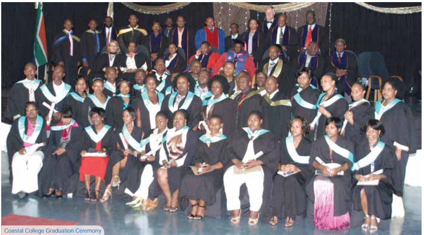
Coastal College Graduation Ceremony